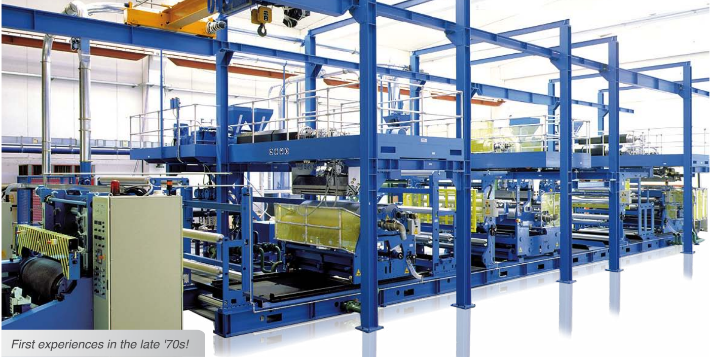
First experiences in the late '70s!