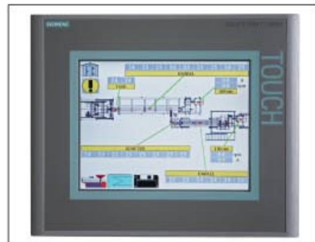
Human Machine Interface: a vital factor in the world of automation

As your single-source provider, Siemens' human machine interface technology SIMATIC HMI is engineered to meet the increasingly complex processes of your machines and systems. SIMATIC HMI is optimized to meet your specific human machine interface needs using open and standardized interfaces in hardware and software, which allow efficient integration into your automation systems.