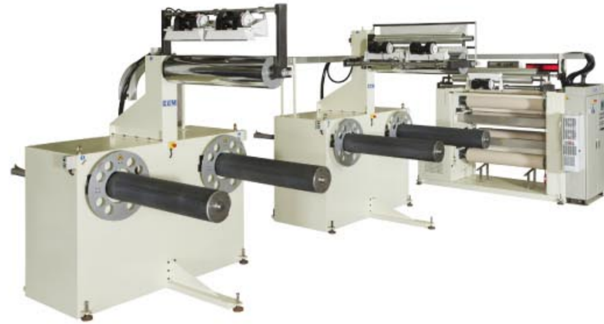
TAKE-OFF UNIT & WINDER