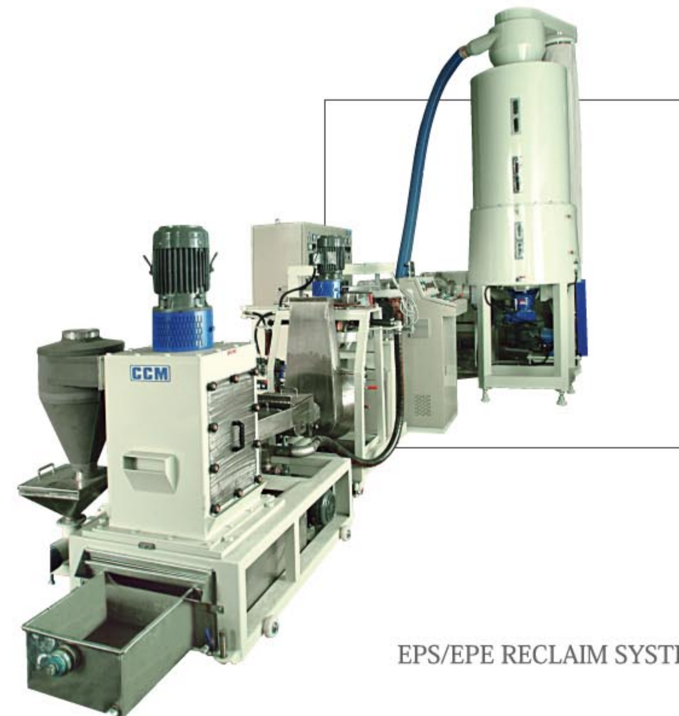
EPS/EPE RECLAIM SYSTEM