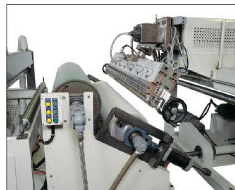
T-DIE & LAMINATING UNIT