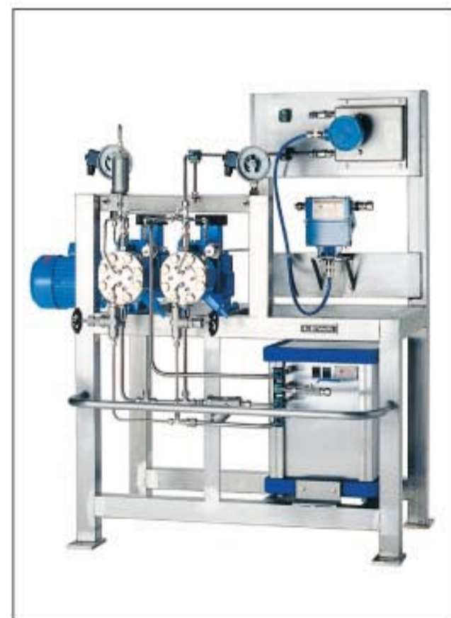
LEWA metering pump